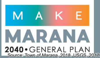
Figures 2-7 and 2-8